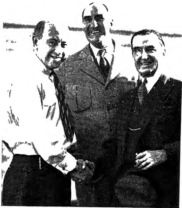
CECIL DE MILLE AND THE LATE ERNEST TORRENCE WELCOME ME TO HOLLYWOOD